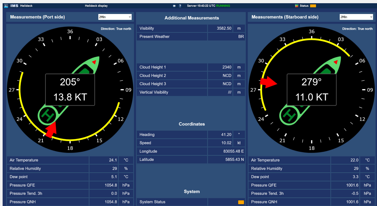
IMS4 Helideck display with 2 anemometer view