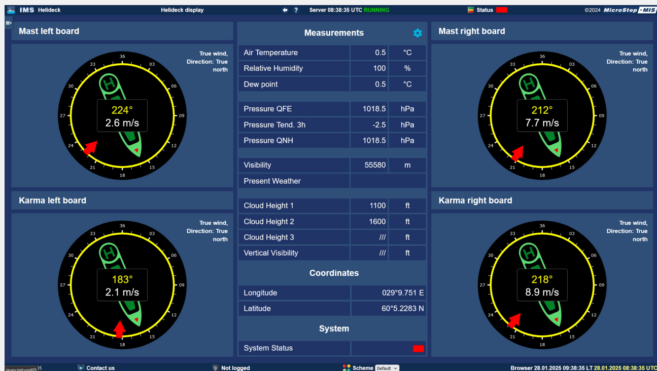
IMS4 Helideck display with 4 anemometer view